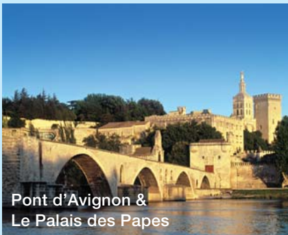
Pont d'Avignon & Le Palais des Papes