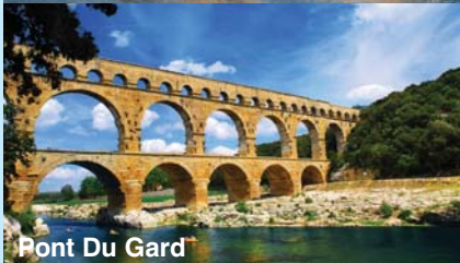
Pont Du Gard